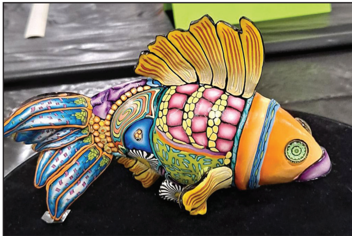
Advanced. The attachment of the fins, tail and eyes are seamless. The surface is smooth and glossy.

competition. Both artists and judges know that no more than 30% of the gourd surface should be covered with clay and 55% of the armature must be gourd(s) and gourd pieces. “The artist is to provide a photo of the original,